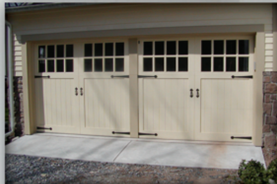
* 16' wide Door shown with optional Simulated Raised Center Post

For finishing, the highly weatherable PVC exterior can be left natural white, or can be Factory Finished. We use High-Performance, Heat Reflective, Molecularly Bonded finishes that carry a full 15 year warranty.